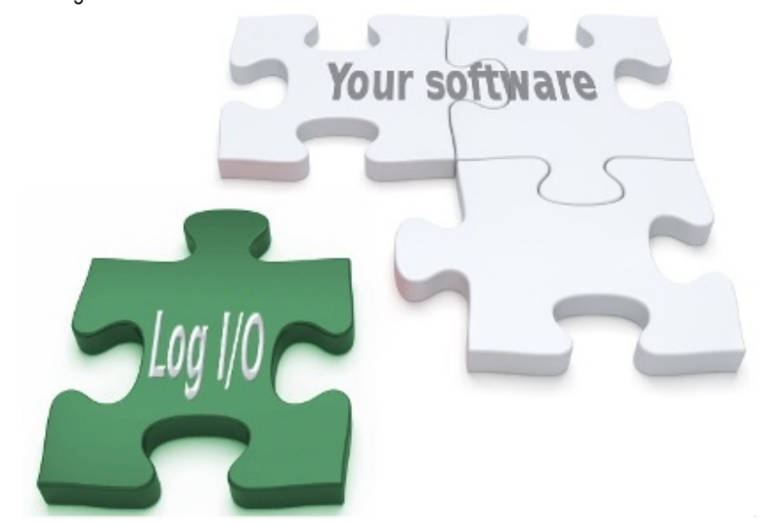
Plugging Log I/O into your software/services, enables immediate access to all types of log data files and gives instant ability to analyze, process and convert the data.

Log I/O is the steppingstone between the past and the future of well logging information management.